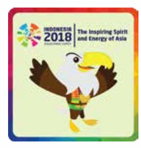
APC, VVIP and Guests