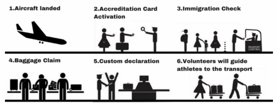
7.Athletes will be escorted to the Athlete Villages